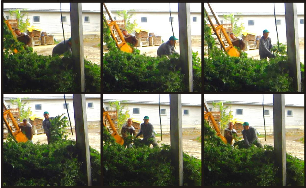
Figure 1. Manual feeding of traditional picking machines

Taking into consideration the different aspects of the stress related to the loading of the picking machine, the number of seasonal workers willing to carry out this task decreased in the past years. The expenditure on manual labour also increased constantly in recent years affecting the hop production in Germany. Hop production is concentrated on relatively small areas and carried out by a modest number of farmers (e.g. the number of involved farms decreased from 8591 to 1294 in the period from 1973 to 2012, while the total area under hop stayed on the same level in this period). Thus, the processing quantities and machine capacities on each farm increased. Hop picking machines are integrated into buildings, are expensive and can be characterised by a high level of complexity, with already identified potentials for optimisation. The most important international and national agricultural machinery manufacturers, however, showed little interest to contribute on the development, because of the small market share and the introduction of new technologies and machines remain on the moderate level.