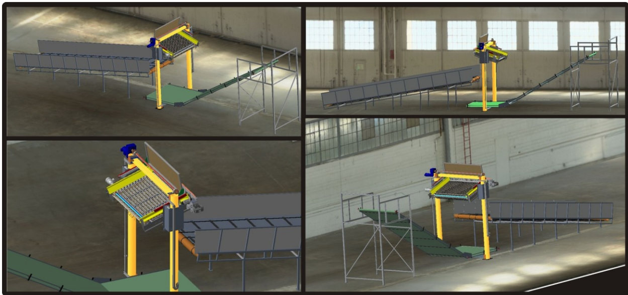
Figure 3. Digital prototype of the automated hop picking machine feeding system

The presented concept of the automated feeding of a hop picking machine is a unique approach, which implies the development of a novel system. Similar projects in the past were accompanied with significant number of errors which were able to eliminate by trials involving additional time and causing extra costs. To avoid such a problem a digital prototype of the system was built allowing tests based on simulation. In the first phase the sketches created during the concept development and existing technical drawings were reviewed and converted into 3D solid models. The models of the existing parts for which technical documentation was not available were created using reverse engineering. In order to provide modularity of the system, already during the concept development, lifting systems common in construction, packaging and assembly industry were evaluated. On such a way and using concurrent engineering the digital prototype was built step by step using Product Design Suite 2012 (Autodesk). Additionally, for most important mechanisms, simulation-ready models were created to carry out kinematical simulations, stress and force analysis. A screenshot presenting the digital prototype of the testing facility is shown in the figure 3.